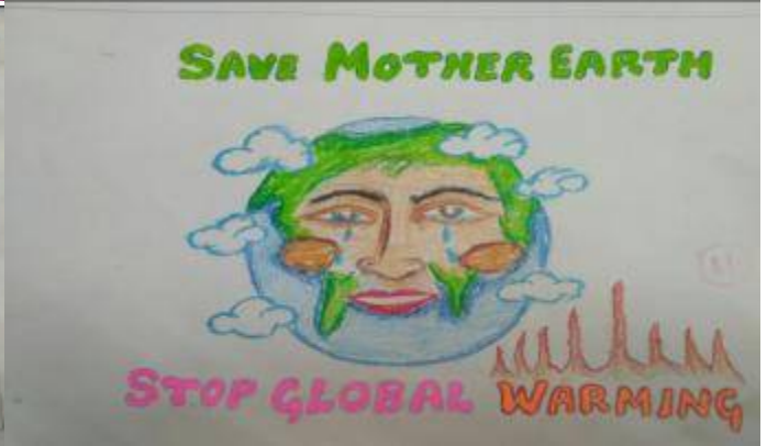
Winning poster designs;